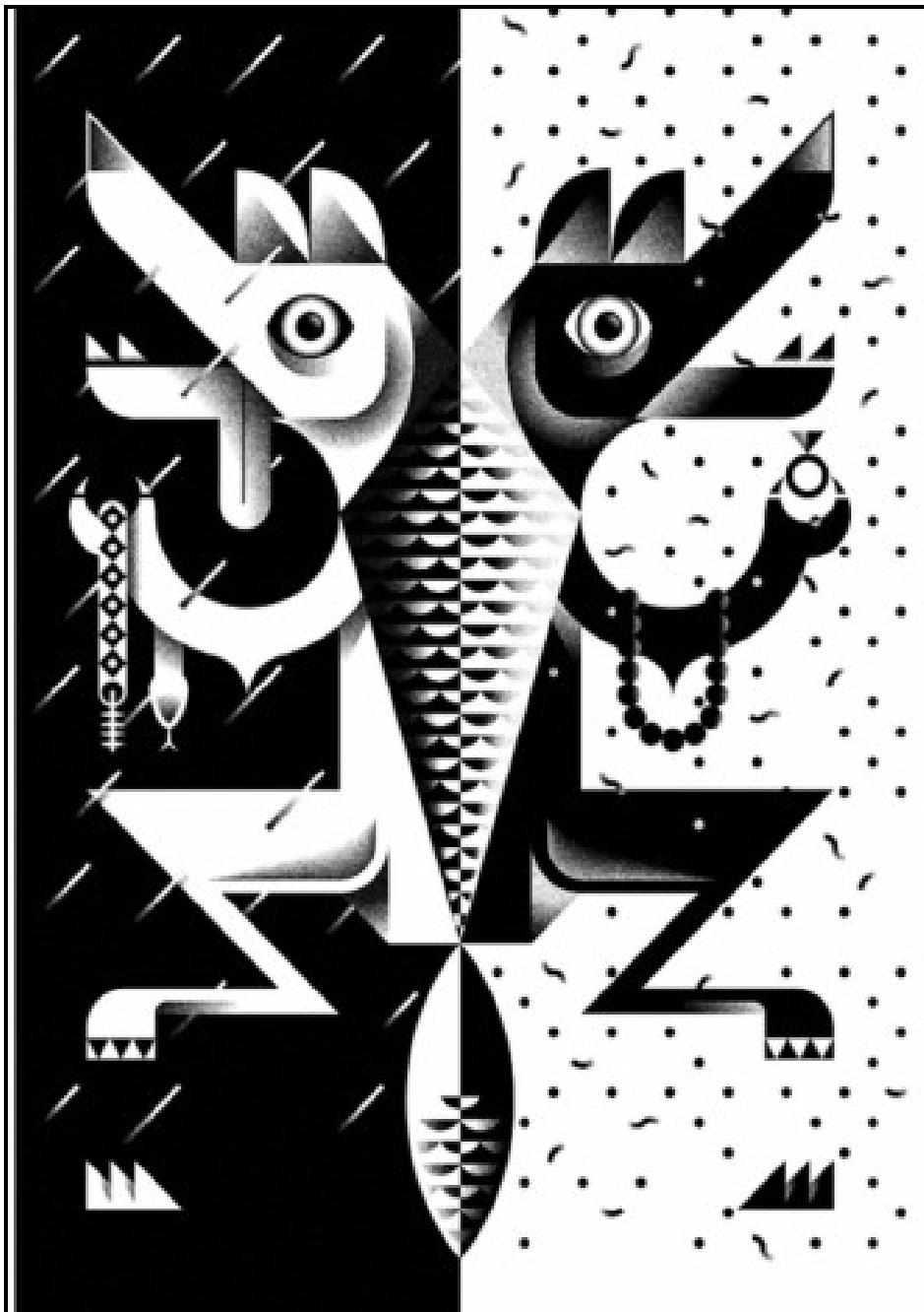
FIGURE B: How the Birds Chose a King (design illustration) by Jono Garrett (Johannesburg), 2015.

1.2.1 Analyse and discuss the use of the following in relation to FIGURE B: