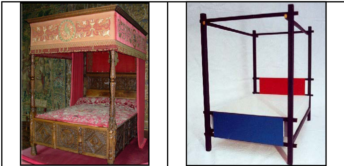
FIGURE H: Renaissance bed.