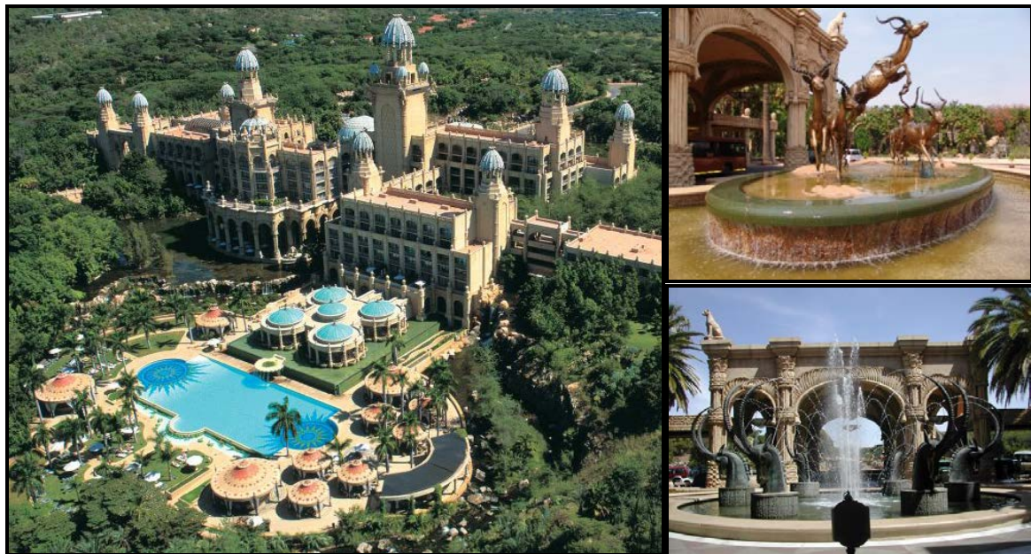
FIGURE G: Palace of the Lost City by WATG (Rustenburg, South Africa), 1990–1992.

Write an essay (at least ONE page) in which you compare the Classical building in FIGURE F with the contemporary building in FIGURE G. Alternatively, you may compare any Classical building with any contemporary building that you have studied.