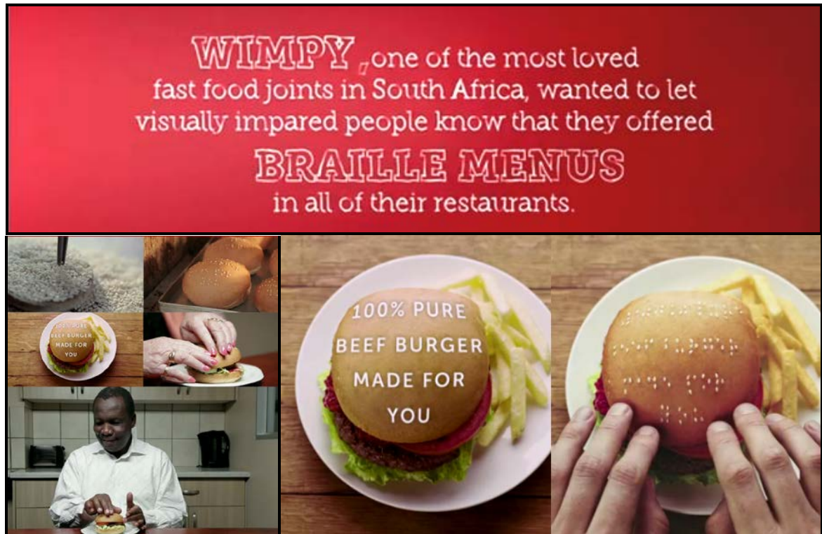
FIGURE J: The Wimpy Braille Campaign by Metropolitan Republic (South Africa), 2016.