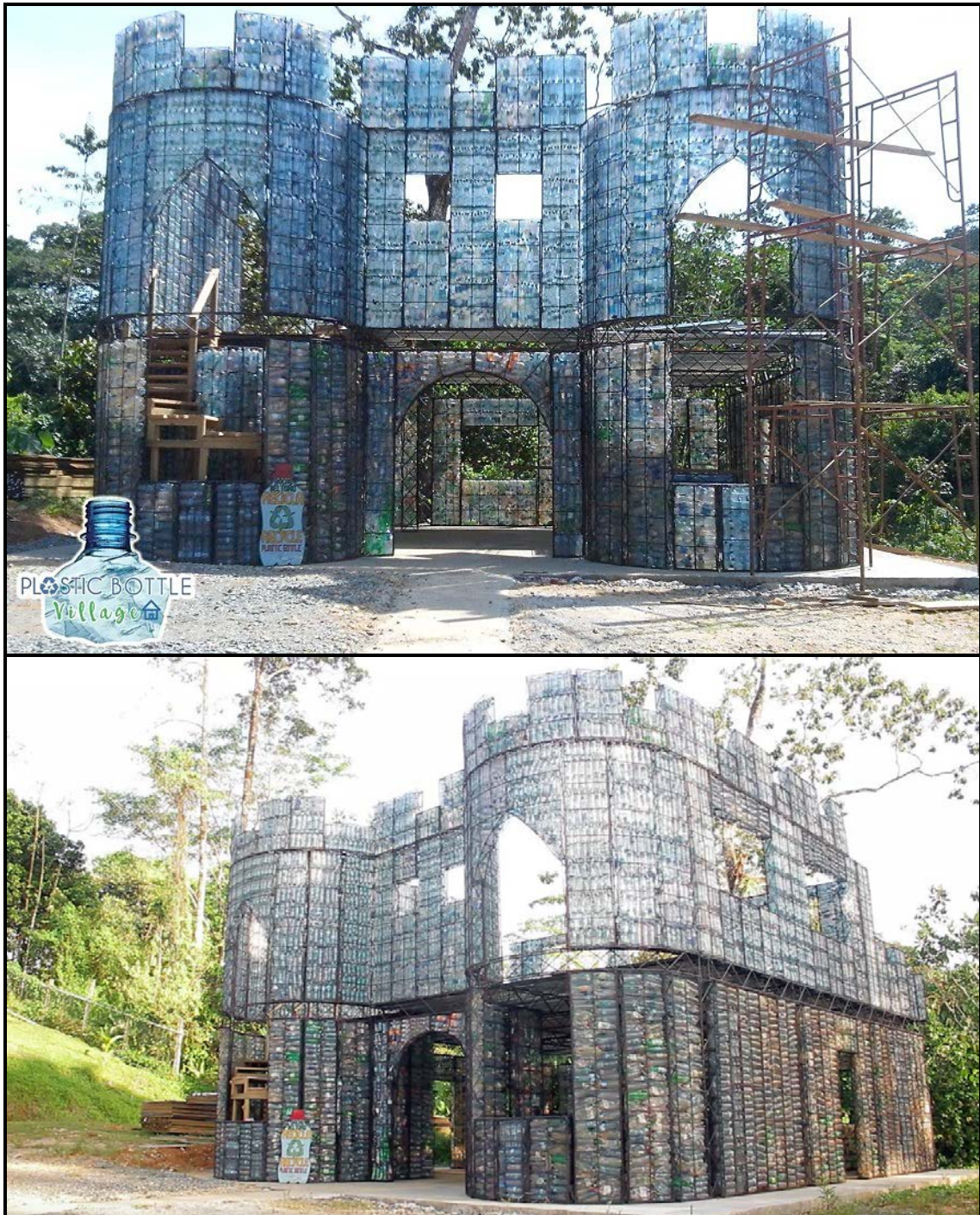
FIGURE L: Plastic village house by Isla Colon (Panama), 2016.

Effective sustainable design solutions comply with the principles of social, economic and ecological sustainability.