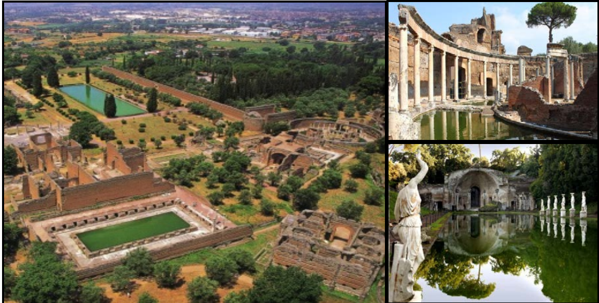
FIGURE F: Hadrian's Villa , architect unknown (Tivoli, Italy), 2 nd century BCE.