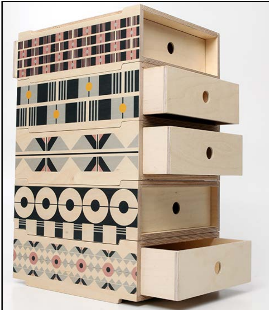
FIGURE A: Chest of drawers by Renée Rossouw and Deáanne Viljoen, De Steyl Studio (South Africa), 2015.

1.1.1 Analyse and discuss the use of the following elements and principles of design in relation to FIGURE A: