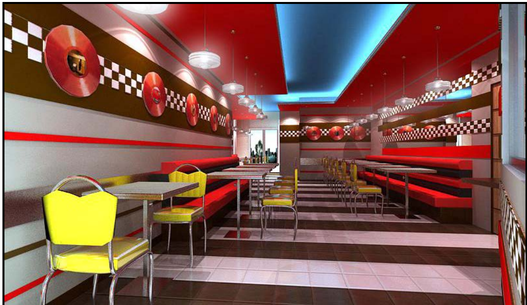
FIGURE E: Proposed restaurant by Kylie Shamini (Turkey), 2016.

In an essay (at least ONE page) compare the interior design of FIGURE D with that of FIGURE E above.