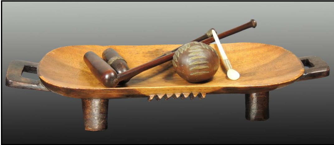
FIGURE K: Traditional Nguni products (South Africa), 1985.

5.2.1 Do you think the traditional products in FIGURE K are still useful today? Give reasons for your answer. (2)